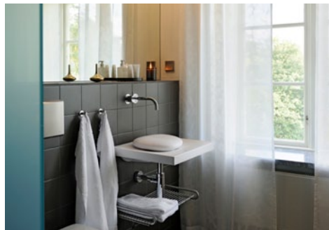
Lush surroundings, beautiful rooms with care for details in a historic building.